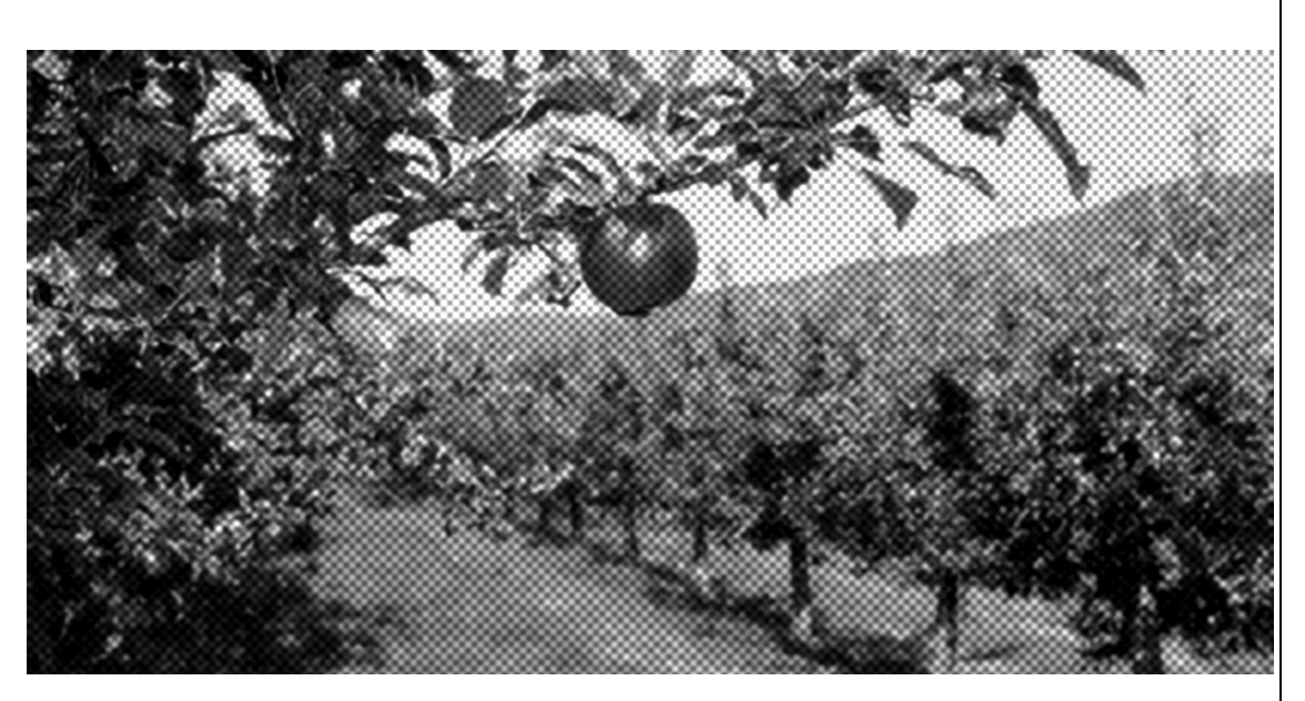
Last fall, the first apples grown in Samazar brought joy to thousands of residents during the first Apple Festival ever held in the Diamond City.